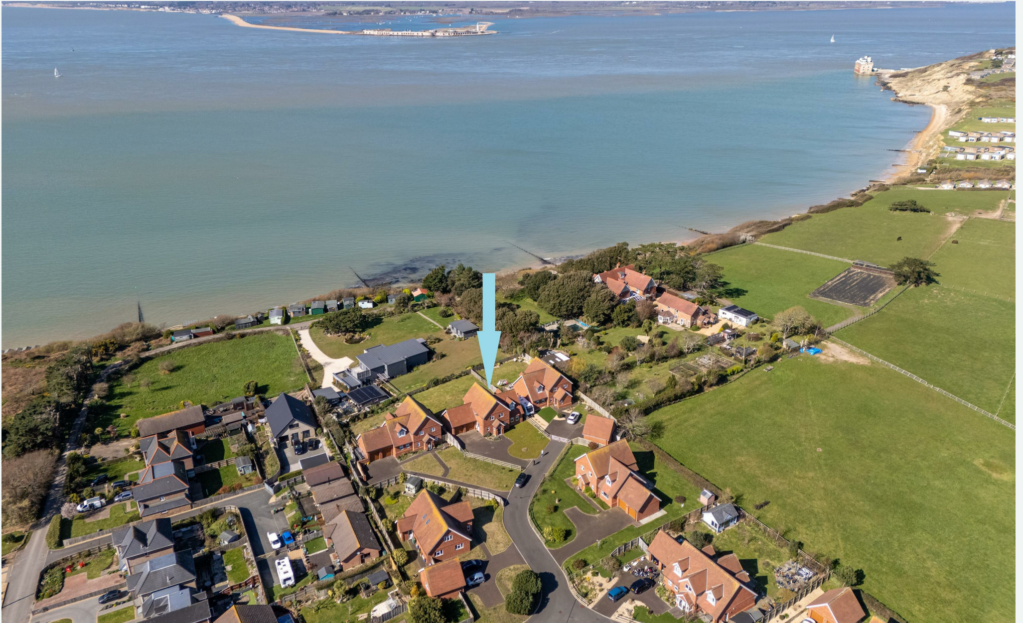
3 Small Horse Farm Close Freshwater, Isle of Wight, PO40 9FY